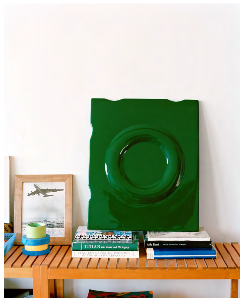
Robert Morris's "Prototype for Earth Project" (1967)